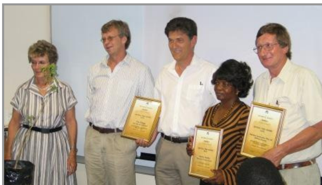
Botsoc Tree Award 2008