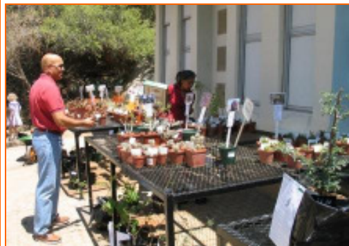
Sale of Indigenous Plants