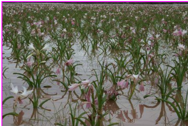
"Thousands of lilies at Farm Sandhof"