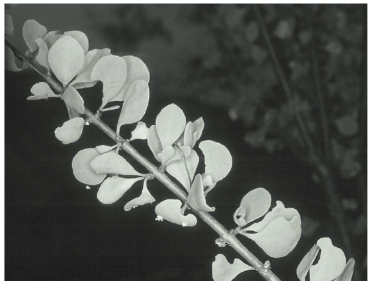
Ceraria carrisoana, leaves